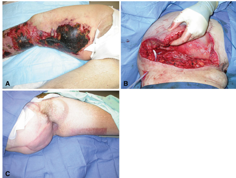
Fig. 3A–C (A) Preoperative photograph of a patient with massive chondrosarcoma recurrence involving the pelvis, perineum, and thigh. Late ischemic/necrotic changes are seen. A hemipelvectomy with perineum/genital resection was performed. (B) Intraoperative photograph after resection. The massive wound was initially managed with a wound VAC with silver negative pressure dressing followed by skin grafting. (C) Postoperative photograph 8 weeks postoperatively from resection. A well-healed skin graft is shown.

the course of the study. Related to that, wound characteristics (such as shape), adjuvant therapies, and host factors were not specifically evaluated or controlled; however, the study groups showed no significant differences in terms of immunosuppression, history of radiation, wound location, and size. Additionally, the study groups are relatively small; however, they were sufficiently large to allow us to detect significant differences between them. Finally, because this study involved a comparison of patients treated in two sequential series, the comparisons necessarily were historical. It is possible, if not likely, that other changes to treatments would have come into play during the time period in question, and it is possible, if not likely, that those cotreatments would have tended to inflate the apparent beneficial effects of silver dressings. Changes in hospital and outpatient care patterns likely also influenced issues such as duration of hospitalization over the period of time considered in this study.